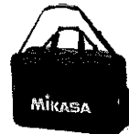
M6B BALL BAG MSRP $39.99