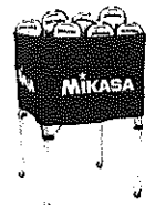
BCSPSH-ROY MSRP $169.99