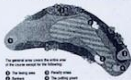
DIAGRAM 1.1: DEFINED AREAS OF THE COURSE